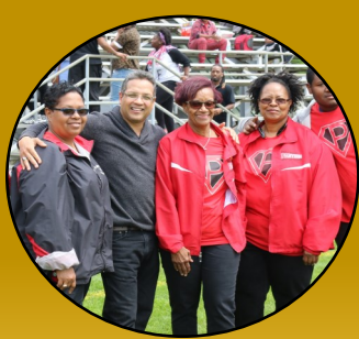
Empower Students, Families, & Communities