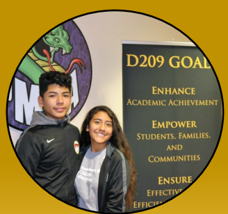
Ensure Effective and Efficient Operations